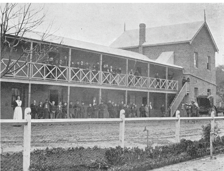
No 4 Boys Home, Mittagong, c. 1908. This is a copy of an image that appeared in the State Children's Relief Board Report for the year ending 5 April, 1908.

Care leavers have reported that the resource has helped them to reclaim their identities. They particularly appreciate being able to see photographs as a way to reconnect with their memories and identities. Access to records also facilitates better-informed counselling services. The website connects care leavers from NSW to Wattle Place, a service to support those people who grew up in orphanages, children's homes, institutions and foster homes in NSW from the 1920s to the 1990s, no matter where they live.