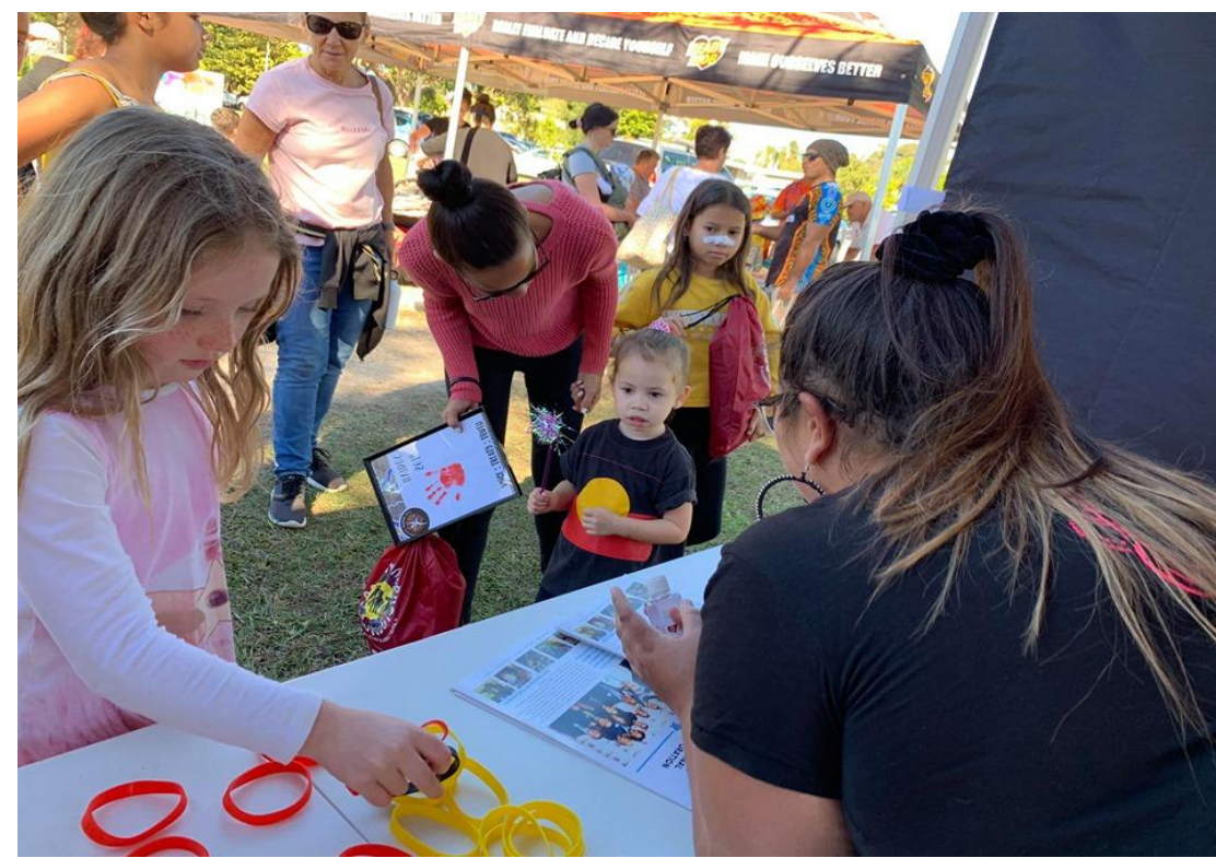
Children participating in community event in Coffs Harbour.