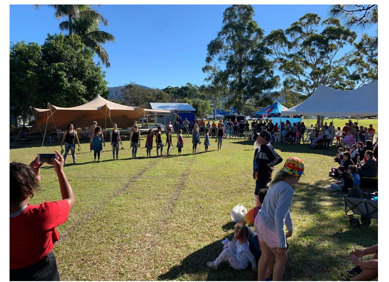
Community events are extremely important for cultural connection and healing.