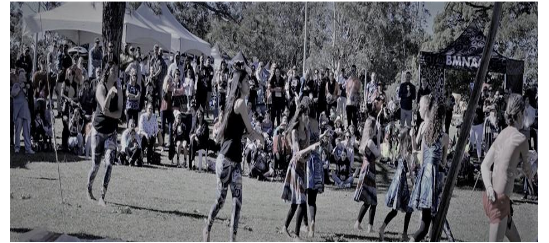
Cultural dance performed at the Coffs Harbour NAIDOC event 2019

This is a direct result of our collaboration and willingness to work together for better results on both sides.