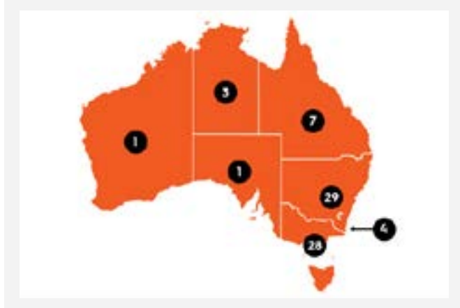
Figure 1: The health justice landscape by state or territory

Fourteen health justice services commenced in the 2017 calendar year and eight in 2018.